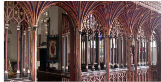
Welcome to The Devon Historic Churches Trust