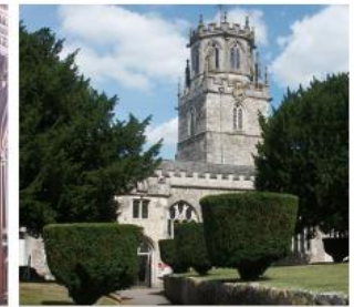
Support Devon's Heritage

The Devon Historic Churches Trust is dedicated to funding repairs and maintenance to places of Christian worship in the Diocese of Exeter and throughout Devon.